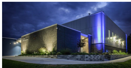
Above: Top to Bottom: Ham- burg Central School District, Buffalo Public Schools, Buffalo Public Schools, Alden Central School District. Right: Lewiston Porter School District.