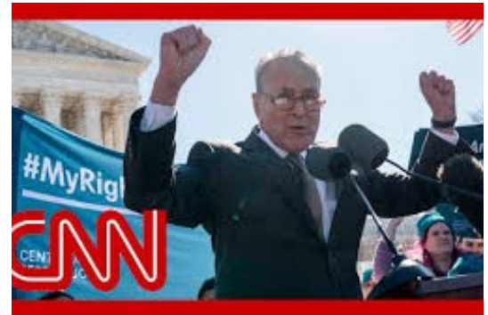
Left: Senator Chuck Schumer appears on "Face the Nation". Above: Senator Schumer appears at a Pro Life Rally in Washington, D.C..