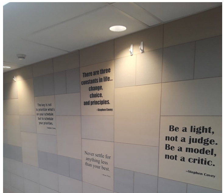
that are located in the hall outside the High School Library where students are able to read and contemplate the quotes on a daily basis and how the quotes apply to their life. There are a few schools in the area that use the 7 Habits of Effective Leaders in their character Education programs.